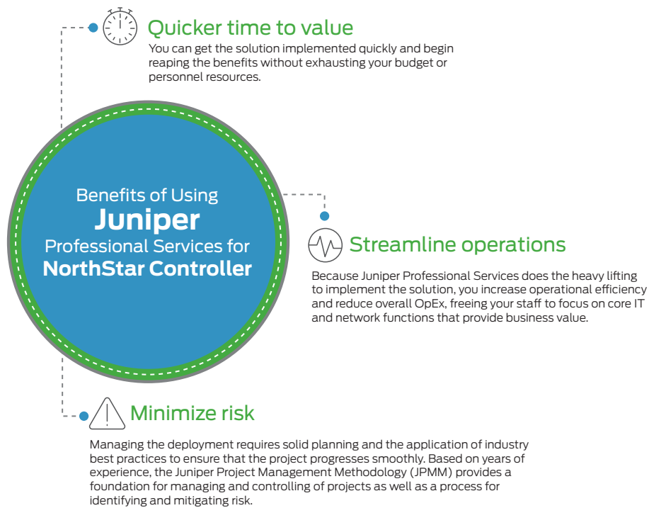
Figure 2. JumpStart service benefits